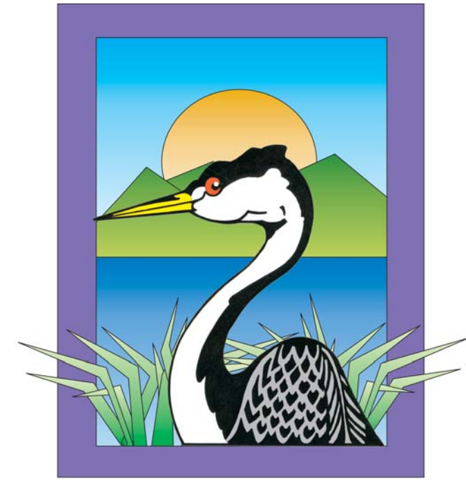
Mating Dance of the Western Grebe

SALMON ARM BAY NATURE ENHANCEMENT SOCIETY